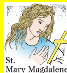
St. Mary Magdalene